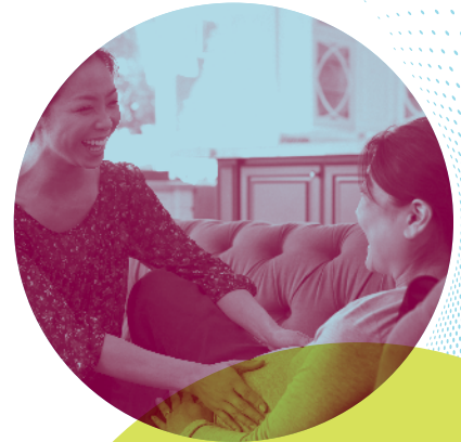
Chart your path today, and shape the future of midwifery in Canada and around the world.

Designed with flexibility in mind, the MSc in midwifery program is offered through full-time and part-time study options, and delivered through asynchronous and synchronous online learning, paired with two in-person residencies. This provides midwives with the opportunity to develop skills in leadership, clinical knowledge, and scholarly advancement, all while continuing a clinical practice.